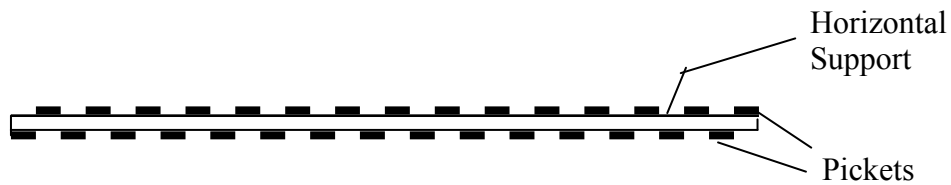
Figure 1b Shadow Box, Top View (not to scale)

Installation: Fences must be level, straight and aligned without wavering. Fences that tie into brick walls must be tapered down to the height of the brick wall at a ratio no greater than 1' drop in vertical height to 3' of horizontal length. The fence must not be seen over the brick wall.